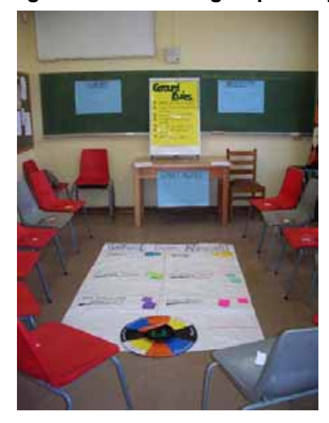
Figure 2: The focus group set-up

Many of the activities were not suitable for recording and so the lists generated by the activities form the data from these large focus groups. Where the lists were written in Afrikaans or IsiXhosa, the Afrikaans or IsiXhosa speaking facilitators provided translations.