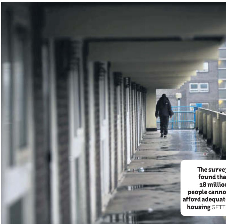
The survey found that 18 million people cannot afford adequate housing

He added: "Tackling the causes of poverty is clearly the right strategy. This report shows that it isn't working. Here, then, is a most major challenge to all the political parties - what is your manifesto going to say to reverse the horrendous rise in the numbers of poor?"