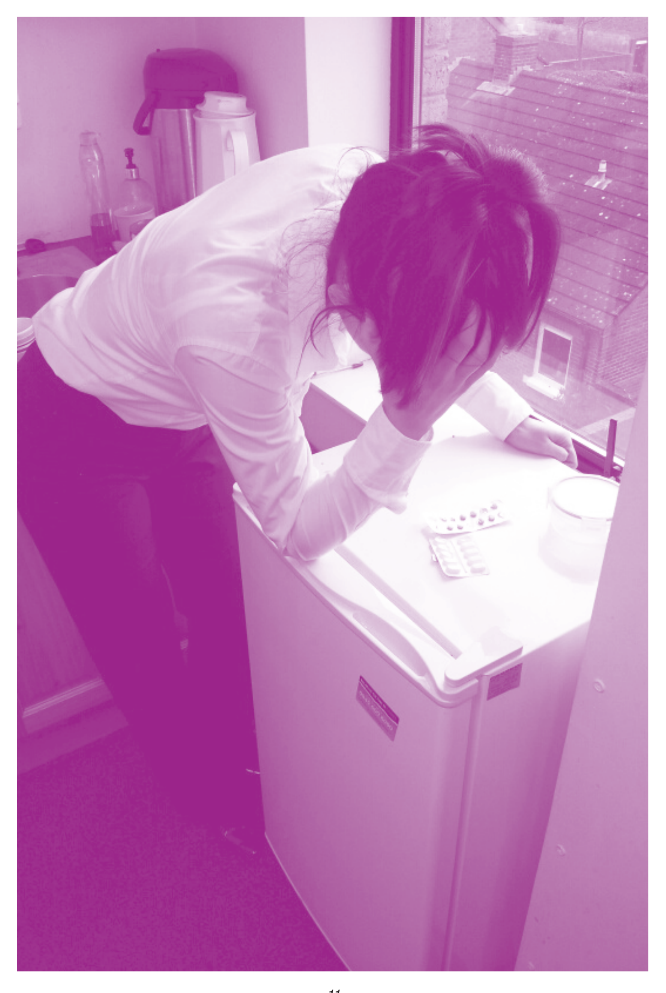
HARD TIMES 2: FEELING THE STRAIN