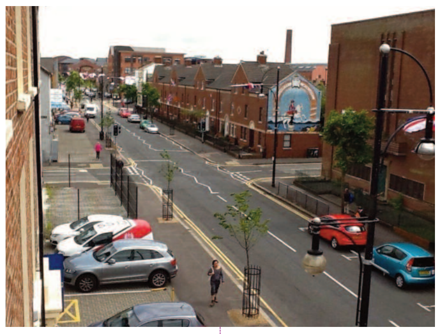
"I think it's scary what lies ahead. If we really sit down and think about it, what lies ahead of us? You know there are no jobs out there, you know there's nothing to look forward to."

Collectively, these experiences tell a damning story of families struggling to cope, borrowing from friends and family, living on credit or falling into a seemingly endless cycle of debt. Some families are in deep personal and financial crisis.